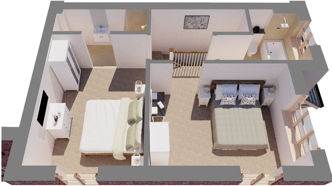
Plots 4 & 5 3 Bedrooms