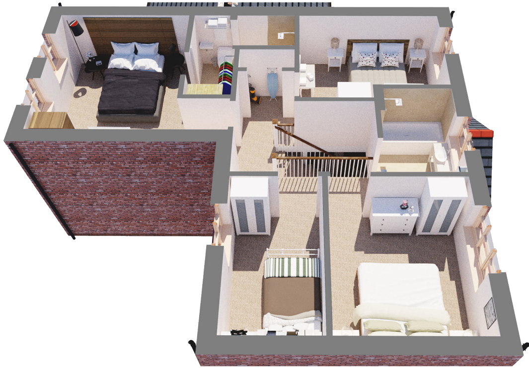
Plots 8 & 9 3 Bedrooms