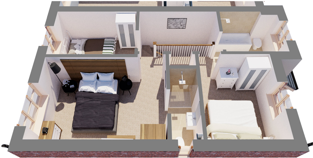
Plots 1, 2, 3, 6 & 7 3 Bedrooms