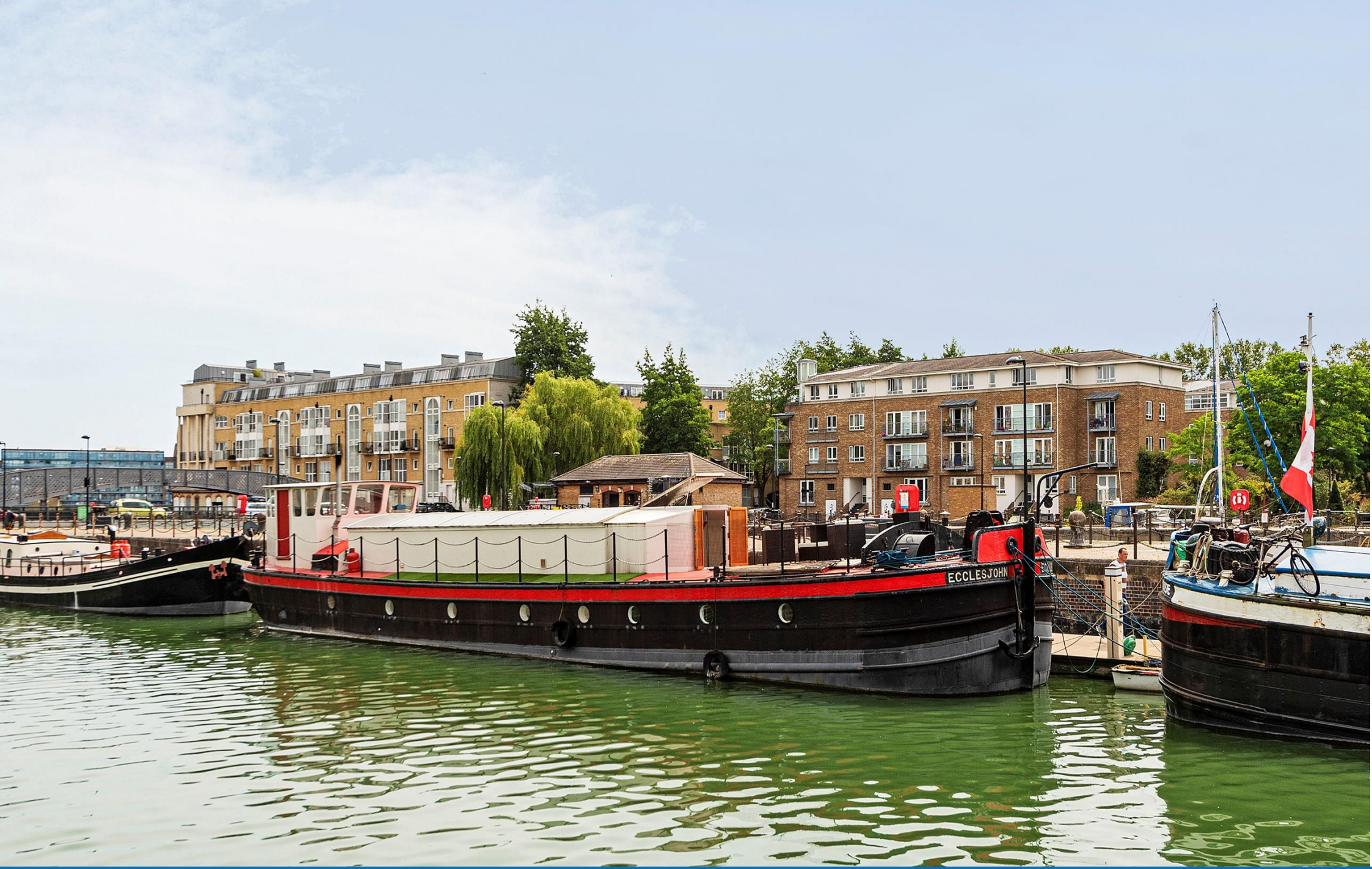
Greenland Dock Marina, Rotherhithe, SE16